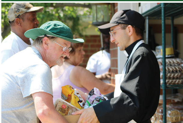
- Peoria, IL - Our priests help distribute the food pantry for the less fortunate -