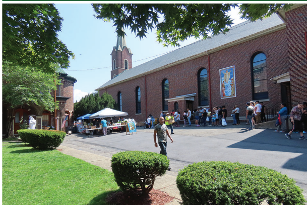
- In Scranton, PA - We help families in difficulty thanks to good food pantry boxes -