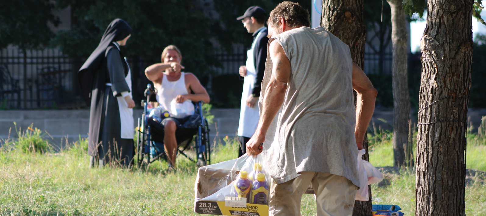
- In Peoria, IL - Helping homeless veterans -

once again give a good juice appreciated by all and a vinegar no less excellent. As for our Religious, they are happy to prepare Christmas for all our protégés: the underprivileged families, the elderly abandoned by their entourage, the poor that we rub shoulders with every day; but they are also busy at their stoves for all the preserves and other good little dishes.