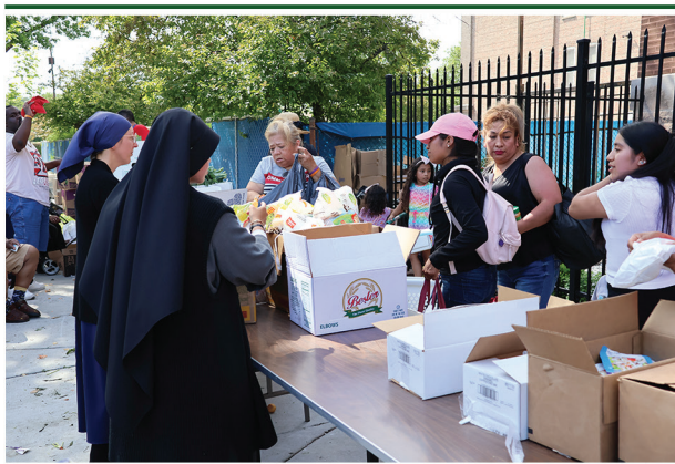
- Chicago, IL - Helping families in need -