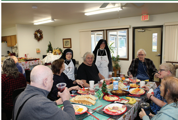
- The Hermitage, WI - Serving senior citizens -